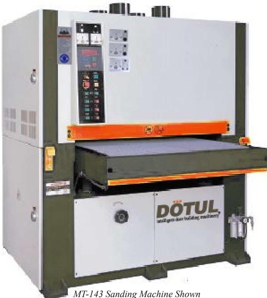
MT-143 Sanding Machine Shown

Our first drum is steel to equalize the surface of the assembled stile and rail style door or cabinet doors. The second drum is rubber to assist in achieving a smooth finish and allow for additional grits to be used. The third sanding head is the final finish allowing the sanding platen to do the final finish with the finest grit paper. Digital controls ensure the accurate and consistent thickness for the sanding process.