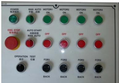
Easy Access Control Panel