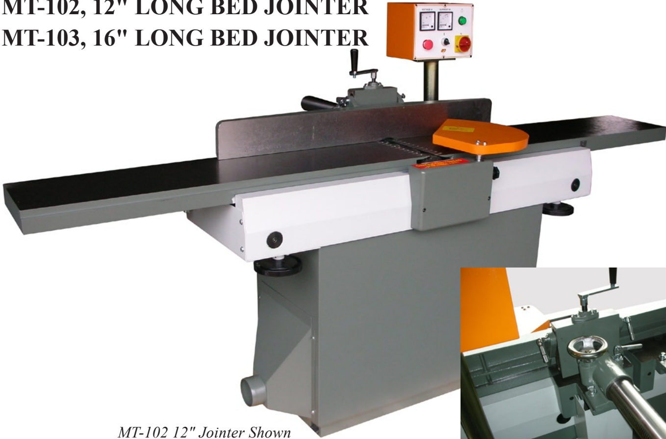
MT-102 12" Jointer Shown

DÖTUL INC, INTRODUCES THE MT-102, 12" LONG BED JOINTER MT-103, 16" LONG BED JOINTER